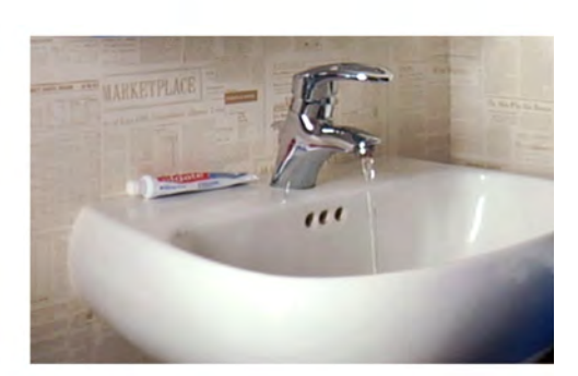
8 Spit into sink