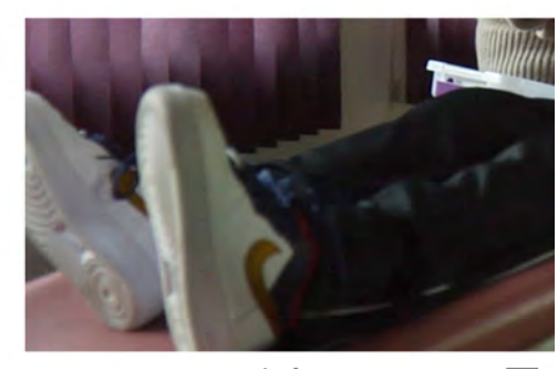
2 Feet out straight